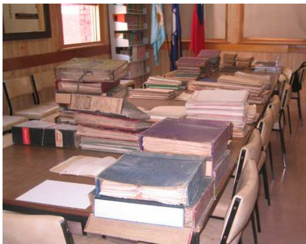
Figure 4. The Archives of the Chinese Consul General, Melbourne