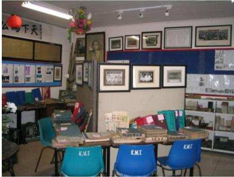
Figure 5. Museum of the Chinese Nationalist Party of Australasia (Sydney)

throughout Australia, New Zealand, and the Pacific Islands. It includes over four hundred sets of materials containing around 10,000 discrete documents, including party membership lists, completed membership application forms, financial records, correspondence and notices, minutes of meetings and conventions, list of donors to various causes, magazine subscriptions lists, newspaper clippings, and internal and external publications (in addition to photograph and artefact collections).